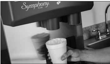
SensorSAFE not recommended for use with clear containers or for applications in direct sunlight