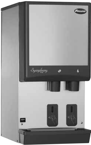
Shown with SensorSAFE™